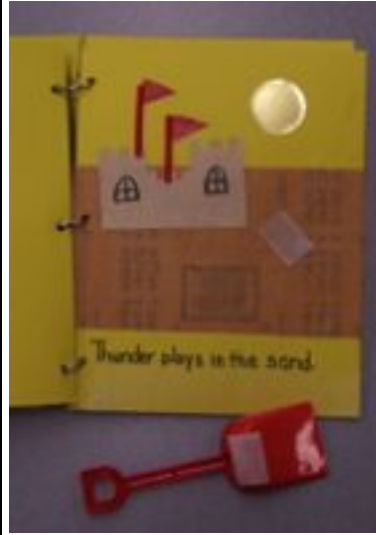
The shovel is attached with velcro, allowing the student to remove it for a full tactile experience as he remembers his day at the beach.