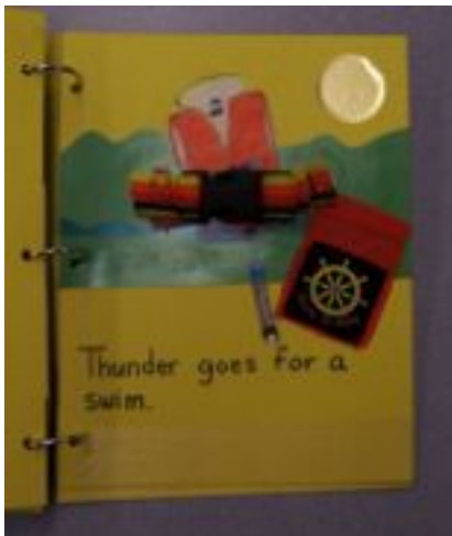
Thunder goes for a swim. Note the buckle and the water wing that has been added to the book.