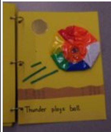
Thunder plays ball. A piece from the top of the bright coloured beach ball has been added.