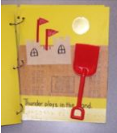
Thunder plays in the sand.